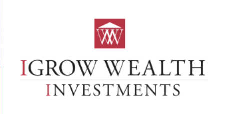
Blouberg, Table View